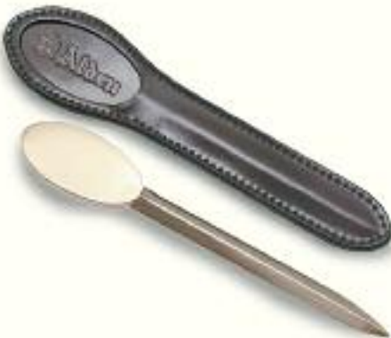
Letter Opener & Sheath LG 5207 Black Cordovan ▶ LG 5208 Color 8 Cordovan