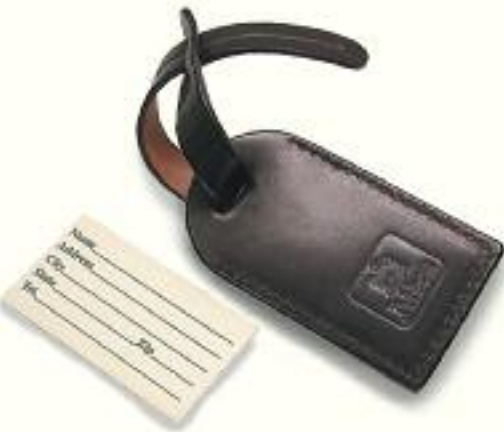
Briefcase Tag LG 1207 Black Cordovan ▶ LG 1208 Color 8 Cordovan